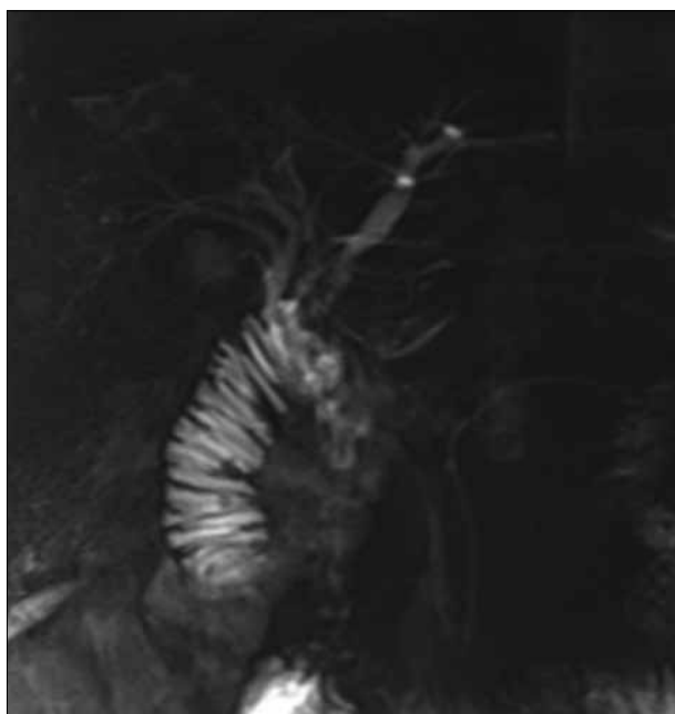
Figure 1. Postoperative MRI/MRCP imaging showing normal passage of contrast agent and satisfying integrity of hepaticojejunostomy

showed slightly enlarged liver with steatosis and dilatation of intrahepatic bile ducts. Right and left hepatic ducts were 9 mm and 10 mm in diameter, respectively. Common bile duct could not be visualized proximal of the insertion of cystic duct. ERCP could not be performed due to the presence of a large peripapillary diverticulum. Considering the progression of jaundice, weight loss, and worsening of clinical symptoms, surgery was performed. Intraoperatively, scirrhous tumorous thickening of the common bile duct was found, involving cystic duct insertion and extending proximally just below, to the hepatic confluence. Surgical procedure included segmental resection of the common bile duct with proximal transection line just below, to the hepatic confluence. After suture placement on distal common bile duct stump, a hepaticojejunostomy with an isolated jejunal loop (Roux-en-Y) was done, using interrupted, resorbable sutures. Postoperative course was uneventful. Postoperative MRI/MRCP showed no obstruction in the passage of contrast agent and satisfying integrity of hepaticojejunostomy (Figure 1).