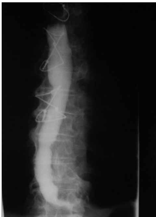
Figure 1. Barium enema study of esophagus showing narrowed esophageal distal two thirds and tapering at the distal end

Achalasia can be treated by drugs (nitrate, calcium channel blocker), endoscopically (botulinum toxin injection, balloon dilation, peroral endoscopic myotomy-POEM) and surgically (Heller's myotomy) [4, 7, 8]. There is a significant difference in therapy approach regarding achalasia type [10, 11]. Type 2 is a predictor of positive treatment response, whereas type 3 and pretreatment esophageal dilatation are predictive of negative treatment response [2, 3].