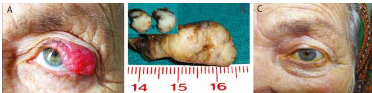
Figure 1. A. Purple-reddish, solid, protuberant, partly nodular lesion, with telangiectatic blood vessels at the surface and some loss of cilia, causing mechanical blepharoptosis; ulcerated periphery of the lesion is from previous incisional biopsy. B. Excisional biopsy specimen. On cut surface, lesion is whitish and sharply circumscribed with just a few small hemorrhages evident throughout (inset). C. Five years after surgery there are no signs of local recurrence with satisfactory functional and cosmetic appearance.