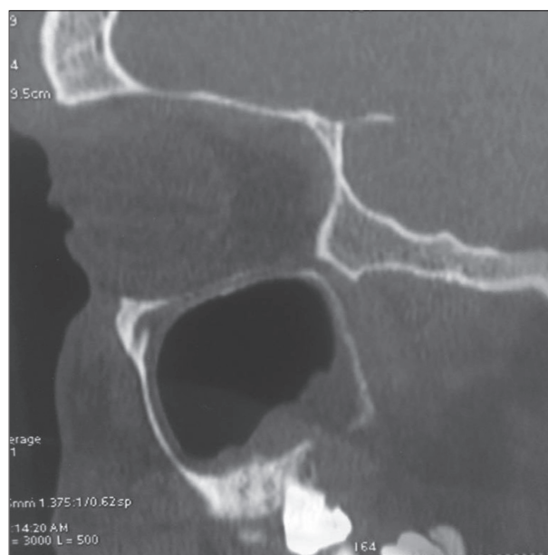
Figure 2. Computed tomogram of patient S; before surgery: the defect of the alveolar process of the right upper jaw, the fistula of the right maxillary sinus with the oral cavity, and thickening of the sinus mucosa are visualised

palpation, and the symptom of fluctuation was positive. When examining the area of a previously removed tooth 1.8, the defect of the alveolar process of the upper jaw was visualized in the retromolar region, with a transition to the vestibular side up to 1.5–1.8 cm. The nasal test was positive. Puncturing the line of mucous membrane closure of the right buccal area, pus was obtained. Abscess of the buccal region on the right and chronic odontogenic sinusitis with oroantral fistula on the right were diagnosed.